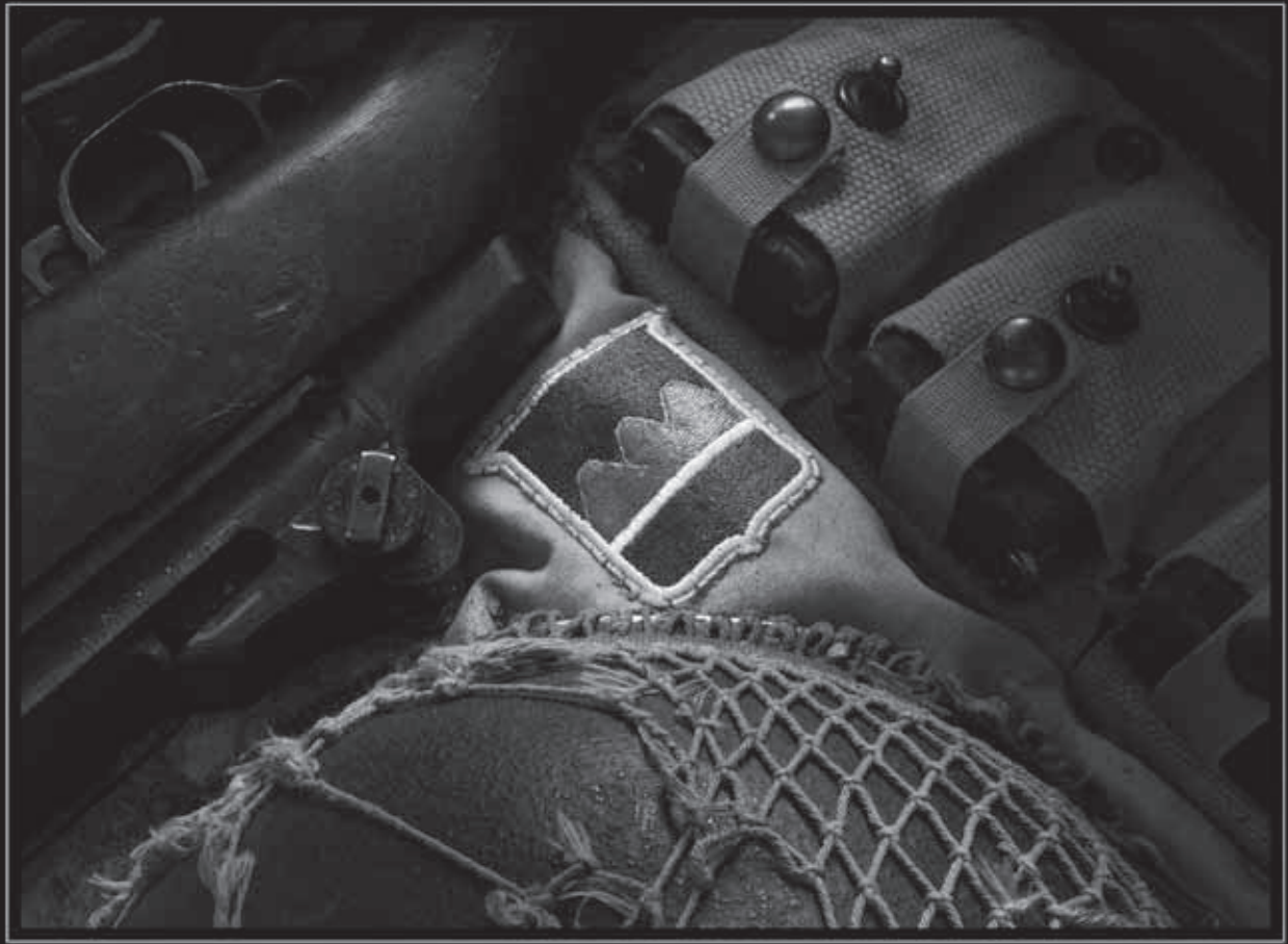
80TH INFANTRY DIVISION BLUE RIDGE BY BRITT TAYLOR COLLINS