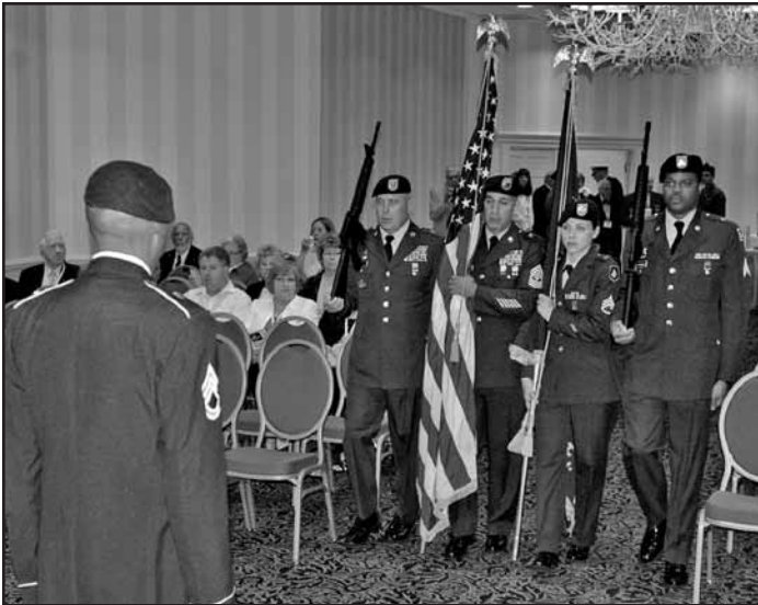
REUNION COLOR GUARD