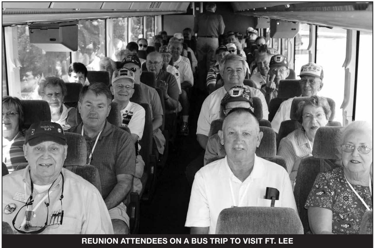
REUNION ATTENDEES ON A BUS TRIP TO VISIT FT. LEE