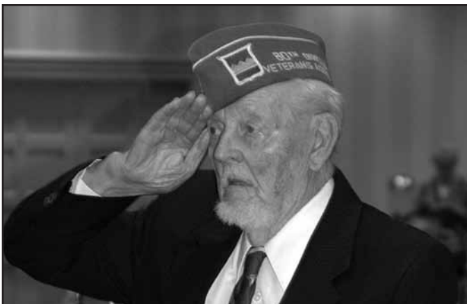
PNC RUSSELL SICK