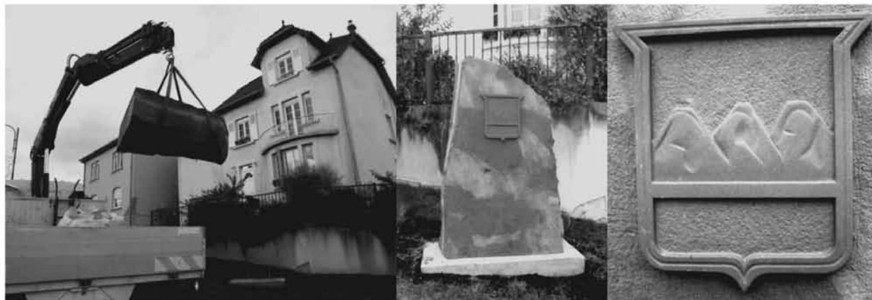
November installation of 80th Division Monument at Seingbouse, France

“Placement of a monument in the village of Seingbouse, France to commemorate it’s liberation in November, 1944.”