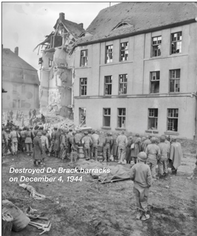
Destroyed De Brack barracks on December 4, 1944

This year’s commemoration ceremony included the installation of a new memorial plaque at the very site of the explosion, honoring the twenty-two men of the 80th Infantry Division who lost their lives on that tragic night. More than eight decades later, their sacrifice continues to resonate, reminding us that even in moments of liberation, danger and loss were never far behind. The plaque stands not only as a tribute to their memory, but also as a lasting symbol of vigilance, gratitude, and the enduring cost of freedom.