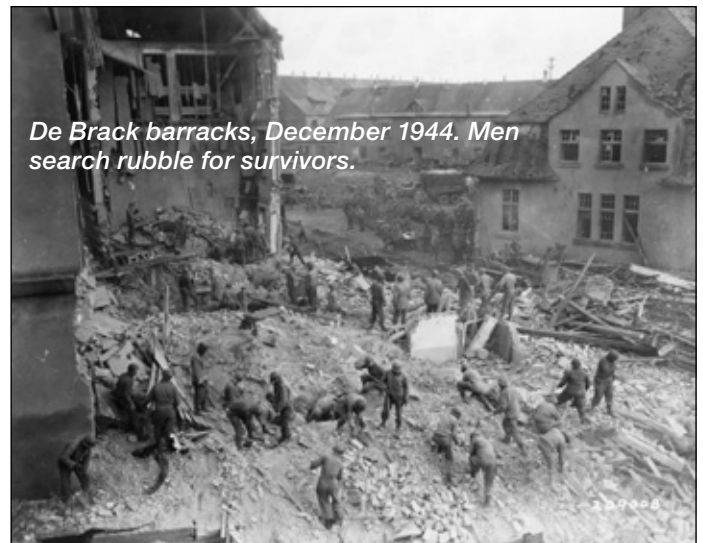
De Brack barracks, December 1944. Men search rubble for survivors.