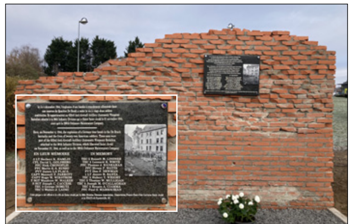
New Commemoration Plaque dedicated to the men of the 80th Infantry Division tragically killed December 4, 1944.