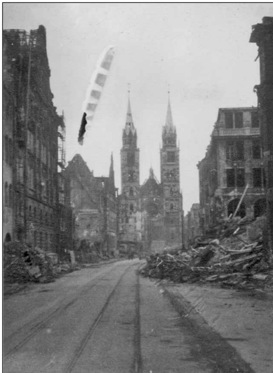
in 1945 during WWII.