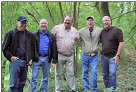
Far left: Charles Falconer's position (80th Infantry) in February 1945, Luxembourg from the Wallendorf, Germany side of Our River. His foxhole was just inside the main (top) tree line, just left of center in this photo.