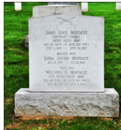
Grave of SSG Willjohn "Billy" Grubbs Montague